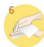
Dry your hands