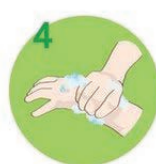
Rub each wrist