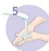
Rinse your hands