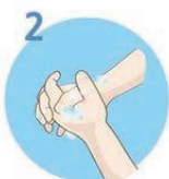
Rub palm to palm with fingers