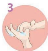
Rub tips of fingers