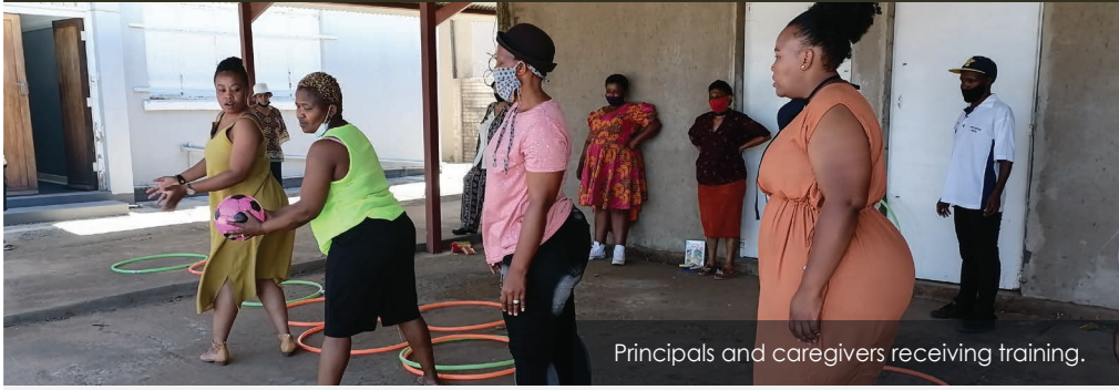
Principals and caregivers receiving training.